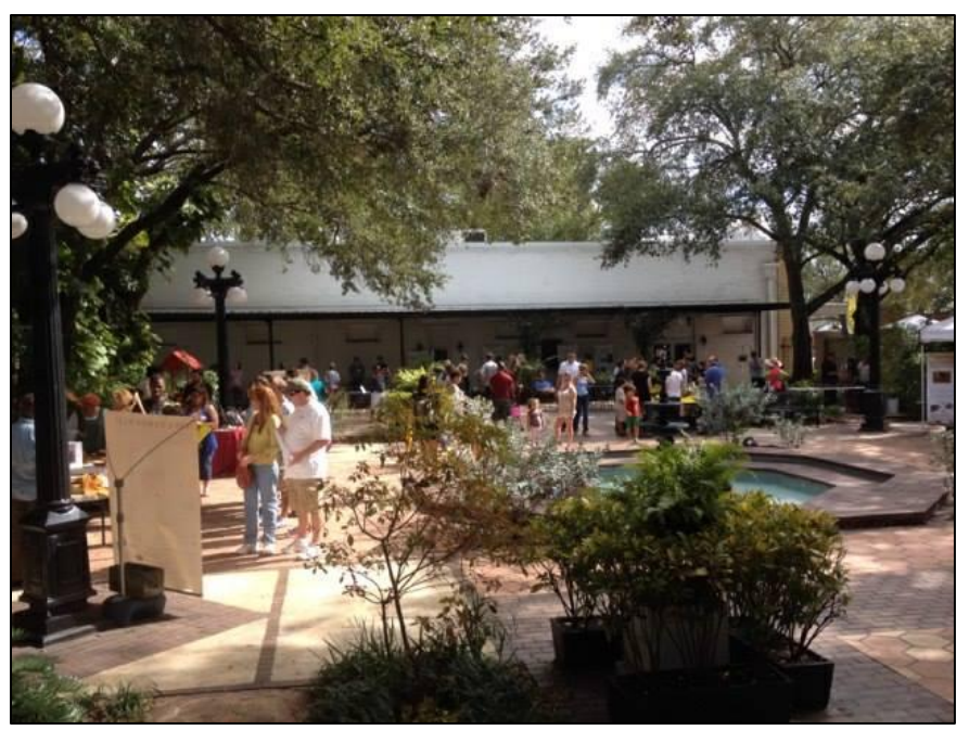
SEAC Public Day at the Ybor City Museum State Park.