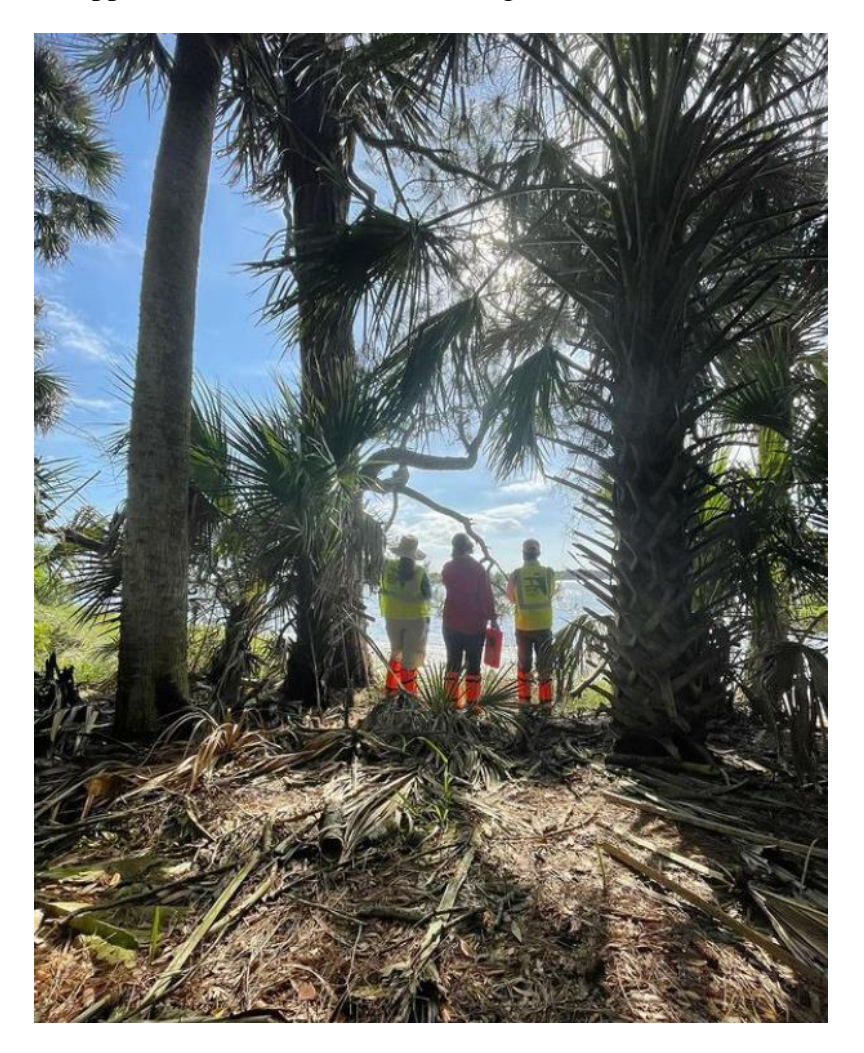
Monitoring sites in the GTM NER

The East Central Region staff, along with Northeast and Southeast Region staff, mapped the erosional edge of the Guana-Tolomato peninsula and monitored numerous archaeological sites. The 3-day shoreline mapping project utilized the Eos Arrow GNNS system to get high end accuracy to track shoreline erosion. The shoreline was mapped originally by FPAN staff in 2020, one year later staff mapped the same shoreline showing areas of erosion and storm damage.