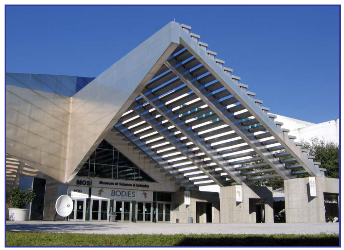
Tampa's Museum of Science and Industry and the location of the Tampa Regional Public Archaeology Center.