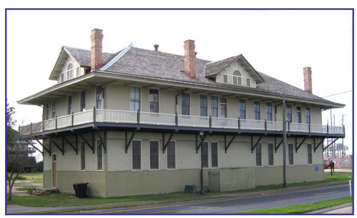
UWF's L&N Marine Terminal: Future home of the Coordinating Center of the Florida Public Archaeology Network.