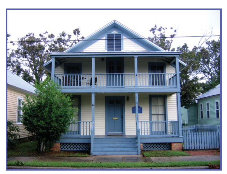
Temporary offices of the FPAN Coordinating Center.

Because rehabilitation of the L&N was still in the planning stages, a temporary location was required. Consultation with West Florida Historic Preservation, Inc., which administers the downtown