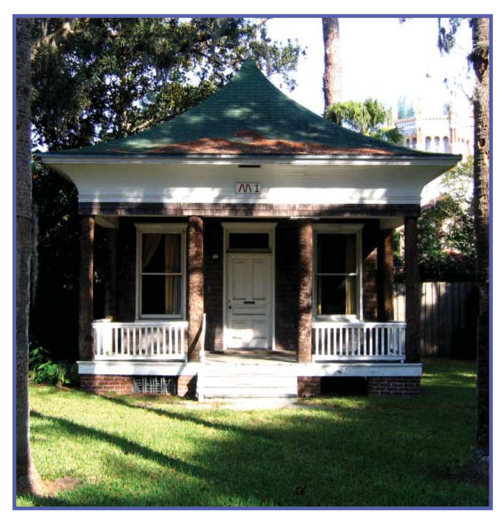
Markland Cottage on the Flagler Campus. Future home of the St. Augustine Regional Public Archaeology Center.