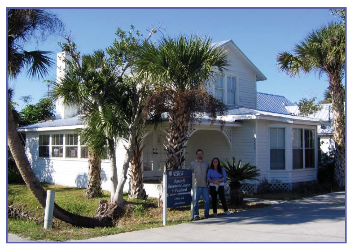
Randell Research Center at the Pineland Archaeological Site. Future home of the Pineland Regional Public Archaeology Center.

visiting public. The Pineland Center will be housed at the Randell Research Center at the Pineland Archaeological Site on Pine Island which has an established local public archaeology program. Each Center will deliver public archaeology services to a multi-county region surrounding their office location.