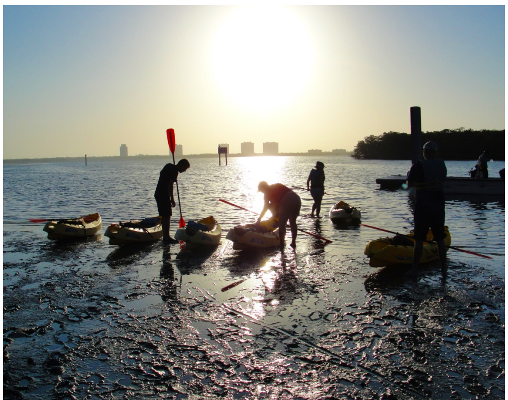
Mound Key Paddle participants get ready to set off

Rangers met participants (6) at the Lovers Key kayak rental and from that location, guided them to the southern landing at Mound Key, the island which is believed to have been the capital of the Calusa chiefdom during early Spanish contact in the 1500s. From the landing, Koreshan Park Rangers provided a guided interpretation of the island from early Calusa inhabitants through early pioneer use of the island. Annette provided support interpretation about shell tools and how the Calusa utilized the resources in their environment to thrive. The SWRC has already scheduled future paddle events to continue developing a strong collaborative relationship with the Koreshan State Historic Site and Mound Key Archaeological State Park and build public excitement about archaeological sites open to the public in our region.