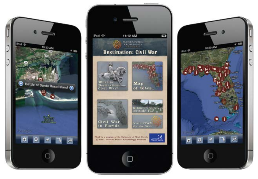
Destination Civil War iPhone App

information on Civil War sites in Florida that are open for public visitation, and links to FPAN's Destination Civil War web site for detailed information and photos of each location.