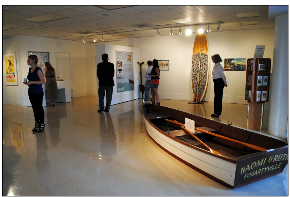
Visitors enjoy "Then and Now: Life Along the New River" exhibit

The exhibit was attended by a SE staff person for over 60 hours during the November and December for a total of 20 gallery days and 337 attendees. Meetings of the Greater Ft. Lauderdale Alliance Governor Council, Ft. Lauderdale Chamber of Commerce, and Florida Public Archaeology Network Board of Directors all occurred within the gallery; these were