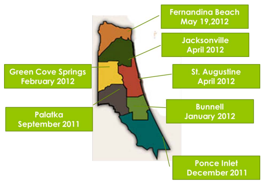
CRPT workshop location within the Northeast Region

cemetery for the Florida Master Site File. More workshops are planned for the 2012-2013 fiscal year beginning with partnered offerings in other regions.