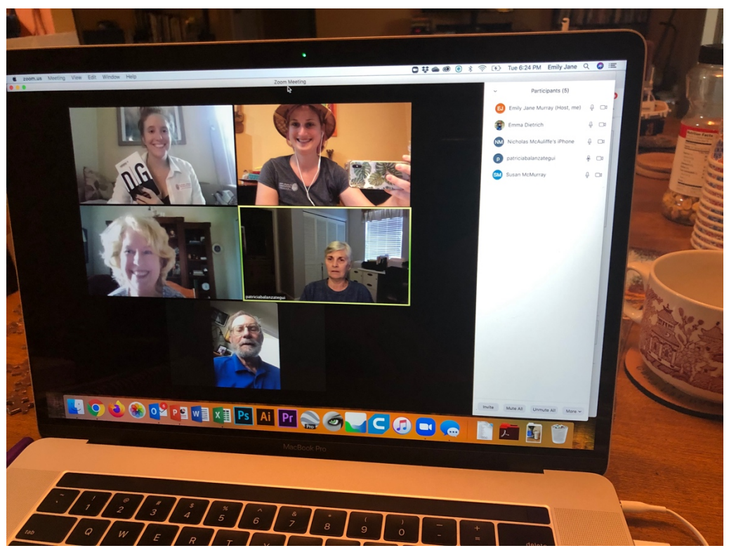
This year, the Northeast Region's Summer Archaeology Book Club went virtual as attendees discussed books via Zoom.

The Northeast and East Central regions held a joint virtual Summer Archaeology Book Club. In total, eight participants met one three dates to discuss three different books via Zoom. Books included <u>The Dig</u>, <u>Gods of the Upper Air</u> and <u>Submerged History: Underwater Archaeology in Florida</u>.