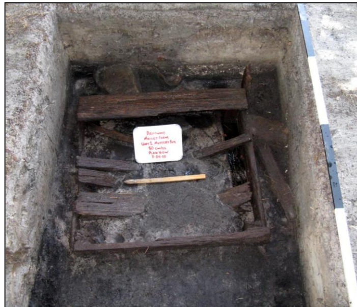
Top of Mystery Box, Unit 1, Mullet Farm.